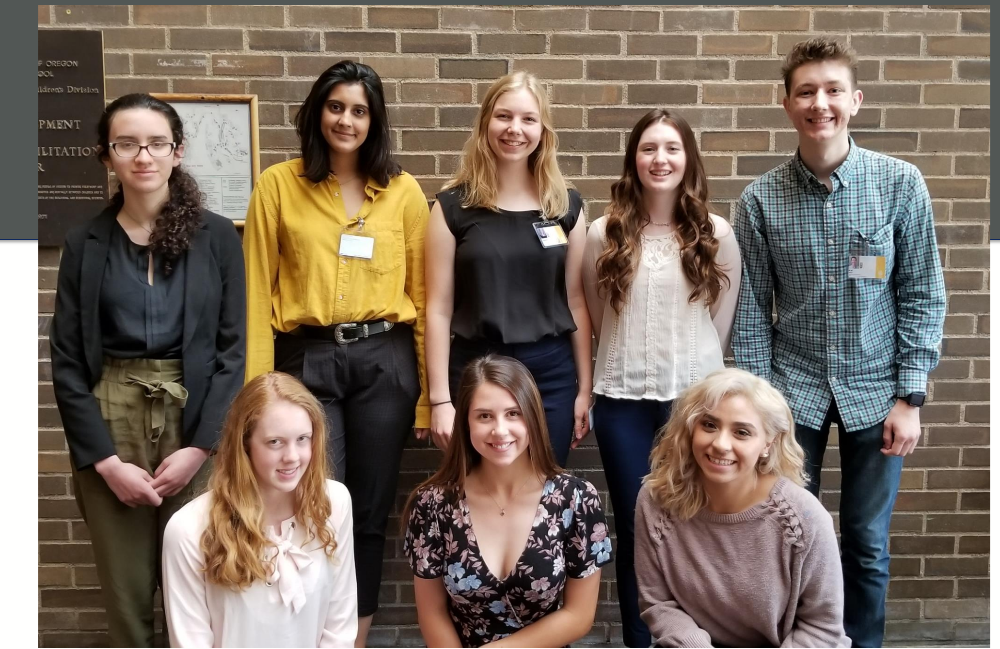
Image: 2018 Summer Internship Program Group Photo

internship experience. This internship has given me many insights into healthcare of those living with a disability and advocacy skills that I will take with me in my future career. In sharing my experience, I hope I influence others to conduct similar projects within their healthcare system." – 2018 Intern