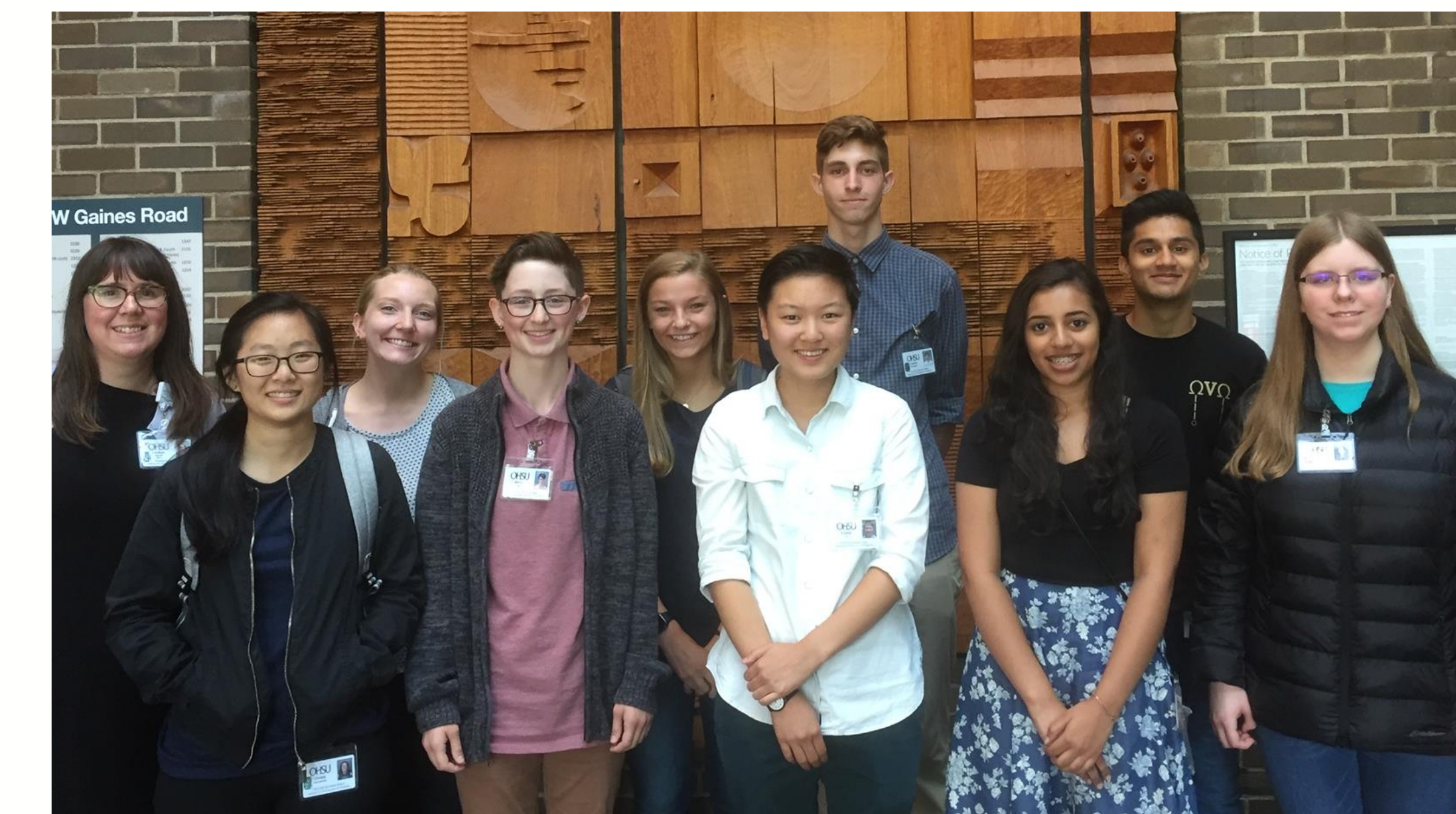
Image: 2017 Summer Internship Program Cohort Group Photo

The experience "both solidified my interest in working within the disability field and solidified my apathy in working as a healthcare provider" and "brought intersectional disability activism to the forefront of my mind." -2017 Intern