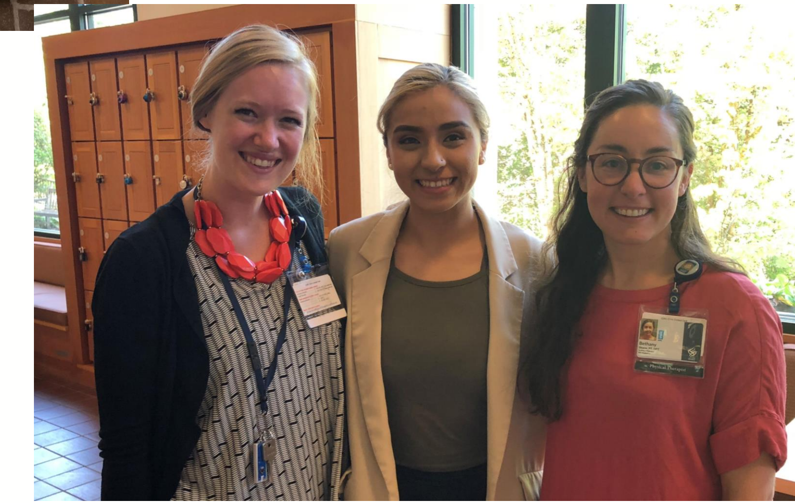
Image: 2018 SIP Diversity Task Force Team

The experience "both solidified my interest in working within the disability field and solidified my apathy in working as a healthcare provider" and "brought intersectional disability activism to the forefront of my mind." -2017 Intern